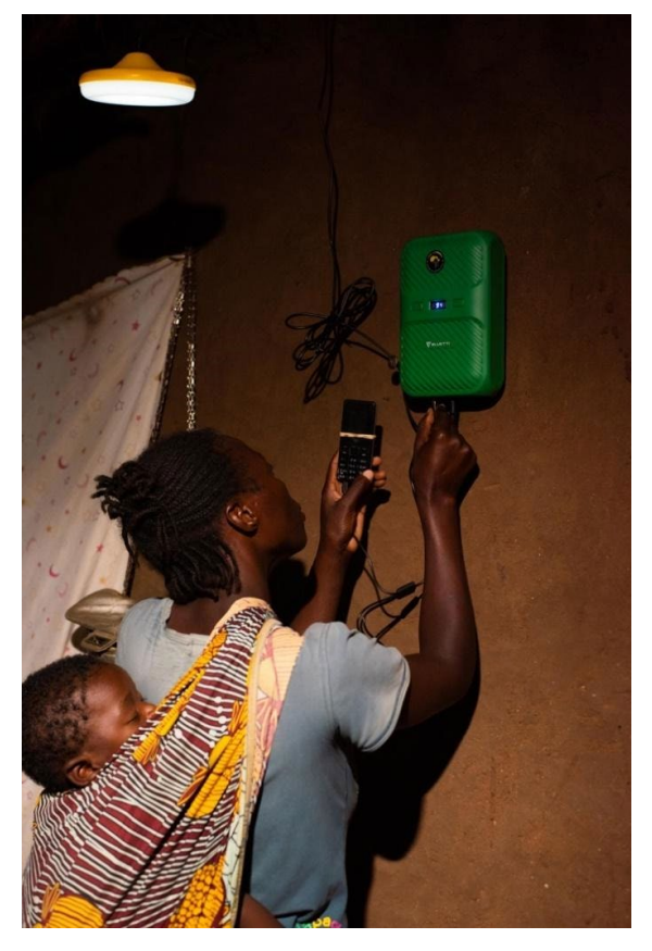
Figure 2: A Zuwa customer in Lilongwe

Core Operations: On the operational side, VentureBuilder supported Zuwa in undertaking an organizational restructuring over the course of 2021, which included revamping its call center to a well-organized Customer Service Team with individual client portfolios. To complement this, VentureBuilder provided strategic support around governance and human resources (HR), including helping Zuwa instill a performance culture, including rolling out performance contracts for key staff. A branch-level profitability analysis supported by VentureBuilder revealed the high costs of establishing and maintaining distribution hubs. Based on this, VentureBuilder helped Zuwa leverage its existing